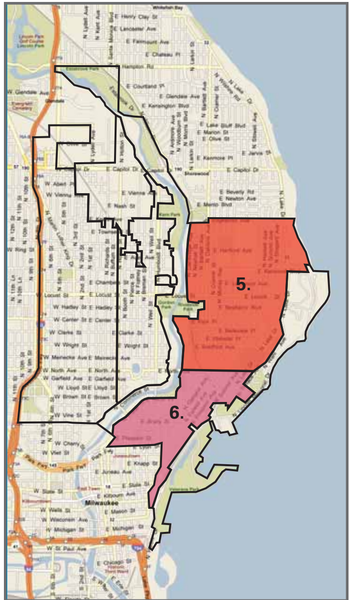
5. Upper East Side 6. Lower East Side