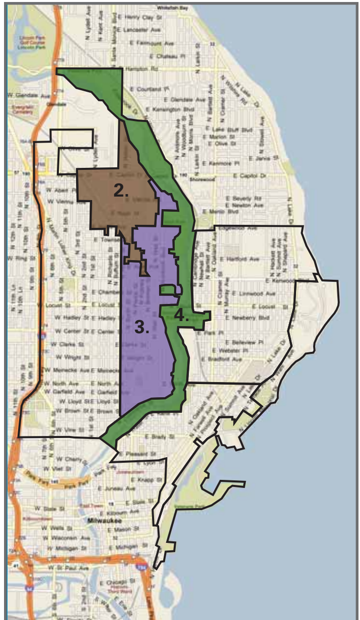
2. Riverworks 3. Riverwest 4. Milwaukee River